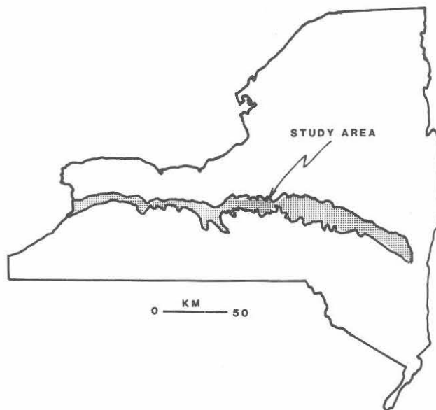
Fig. 1. Location map of study area. Stippled pattern illustrates distribution of marine (Hamilton Group) Givetian rocks in New York.

The Middle Devonian (Givetian) Hamilton Group in Central New York State consists of approximately 1600 ft. (approximately 490 meters) of richly fossiliferous interbedded shales, siltstones and sandstones. During Givetian time, the central New York region lay to the west (present geography) of the Appalachian mobile belt. The sediments derived from this orogen were transported to the west and northwest into an epicratonic foreland basin. Other studies (Brett et al., 1983; Baird, 1979) suggest that deposition in western New York took place on a topographically subdued bottom. Regionally, paleoslope was SW-directed, but local swells and depressions of 20-100 km wave length were present (Baird, 1979). In the region of this study, the Hamilton has been the subject of numerous paleontological studies, from the pioneering work of James Hall through the biostratigraphic studies of Cooper (1930, 1933). More recently, the integration of paleontological data and detailed sedimentologic/stratigraphic studies have resulted in the development of depositional/paleoecological models (e.g. Brett et al., 1983). The purpose of this trip is to introduce participants to the varied faunas and lithofacies of the Hamilton and to document the cyclic arrangement of faunas and facies. It is this cyclicity that provides us with a key to understanding the sedimentological evolution of the Hamilton Group.