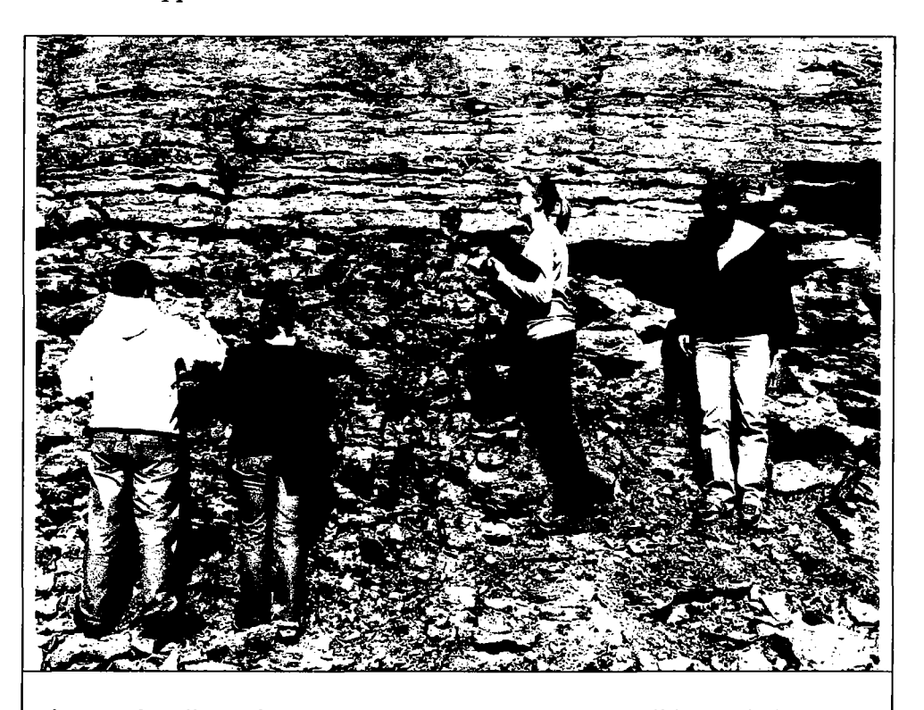
Fig. 1 The disconformable contact between the Kalkberg (below) and Becraft (above) formations on Rickard Hill Road. The prominent reentrant at the contact is a K-bentonite (altered volcanic ash). Four future earth science teachers (SUNY Oneonta students) provide scale.

The Becraft Formation (Lower Devonian) is made up entirely of thick beds of coarse, fossiliferous limestone (grainstones). On many weathered joint surfaces, very well-developed cross-stratification is apparent.