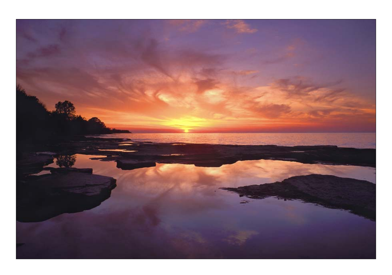
Lake Ontario Sunset