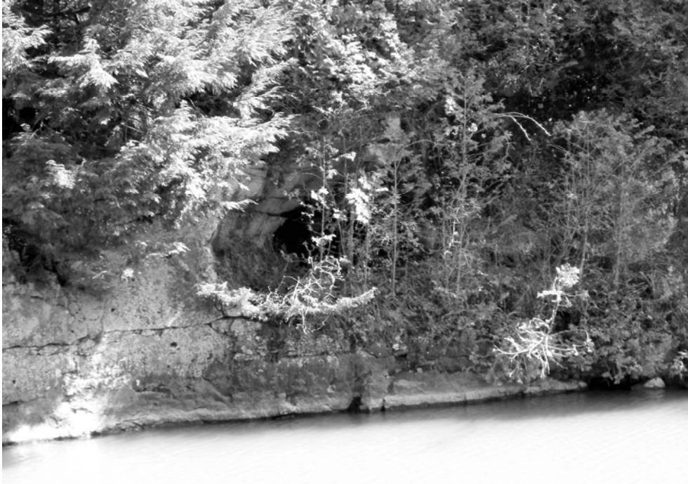
Pothole in Canal Wall