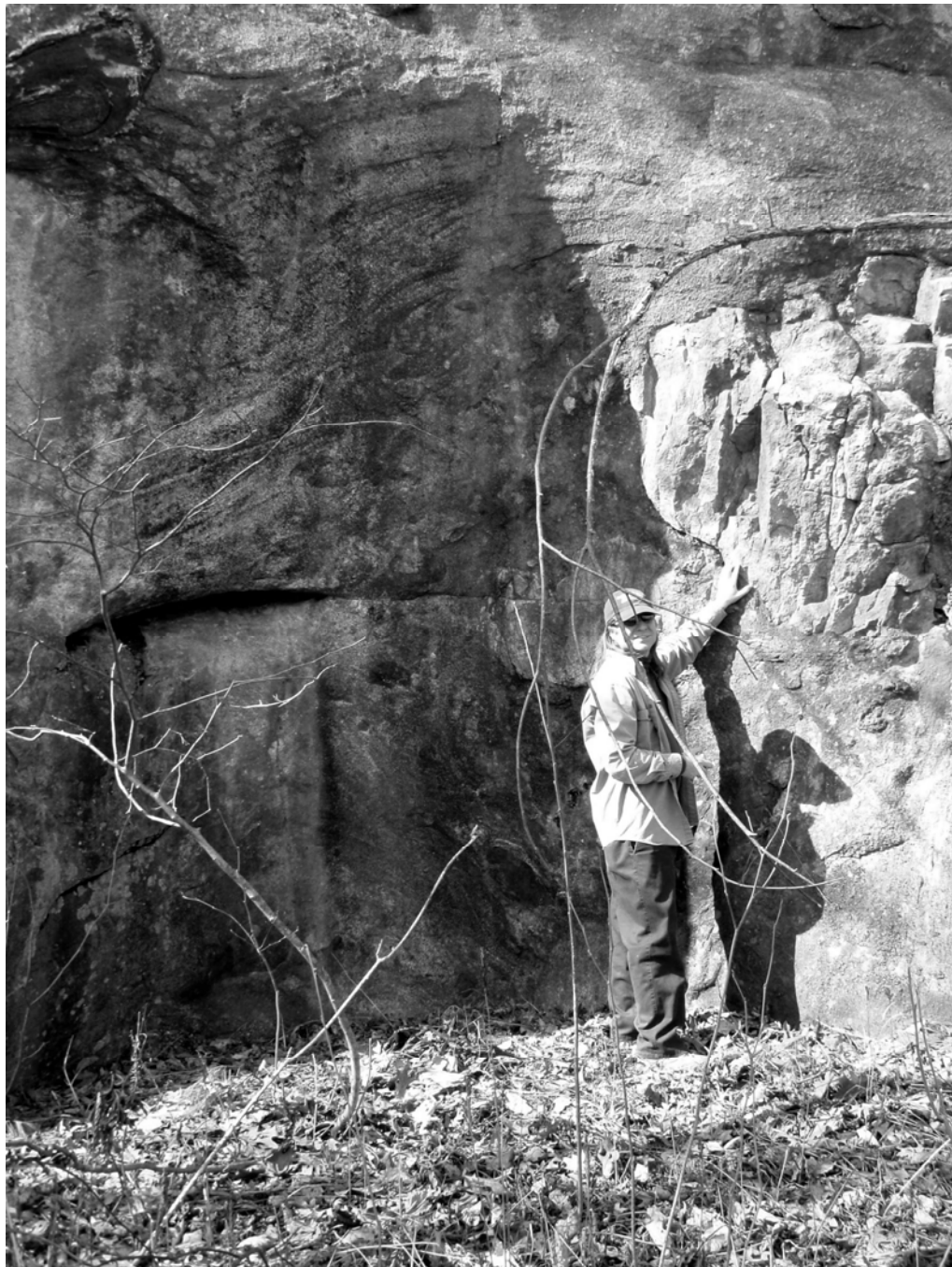
Pothole on Flank of Battle Hill in Gneiss