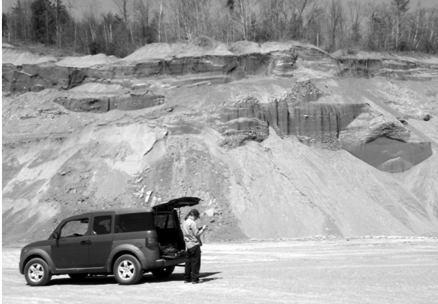
Bottomsets of Street Road Delta.